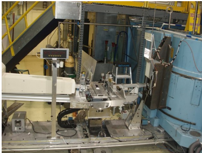
Fig. 2 NG7 SANS (Small Angle Neutron Scattering) beam

Dr. Tao's team used the NG7 SANS (Small Angle Neutron Scattering) beam. The SANS device uses neutron reflectometry, a relatively new technique for investigating the near-surface structure of many materials.