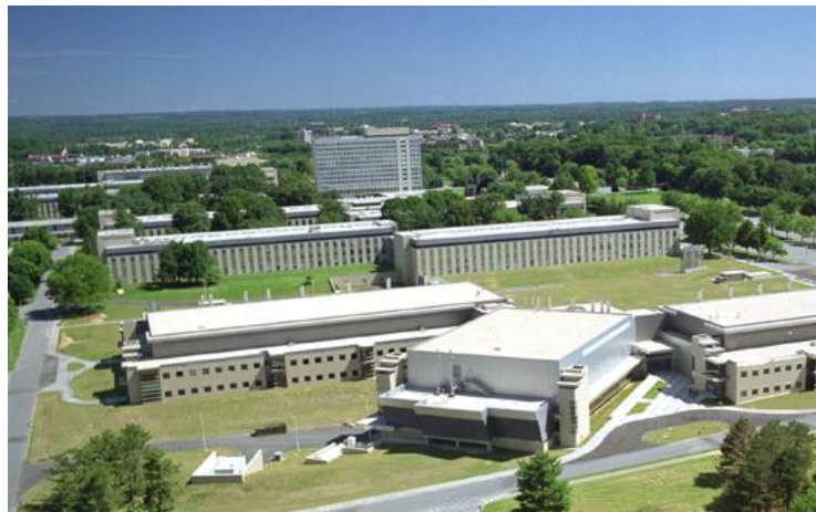
Fig.1 Center for Neutron Research (CNR) at NIST